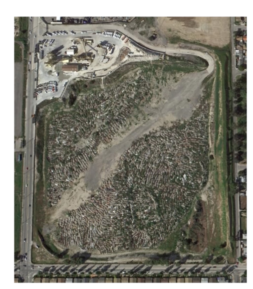
EXISTING LANDFILL SITE