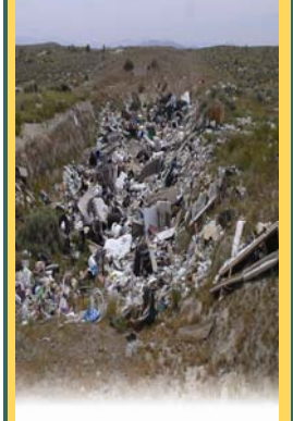
Illegal Dumping site

The Antelope Valley Illegal Dumping Task Force meets at 3 p.m. on the second Wednesday of every month at: Fire Station No. 129 Training Center 42110 6th St. West Lancaster, CA